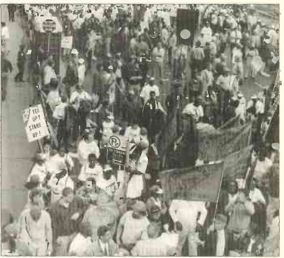
The crowd at the May 12 rally stretched more than a dozen blocks.

The rally had an important message to deliver, and the size of the crowd forced the media to deliver that message to everyone else in the metropolitan area and in other parts of the country. That widespread news coverage was further evidence of the rally's great success.